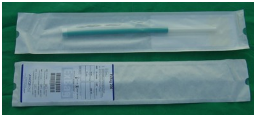
Picture 2: Single, sterile double package (front and back side of package)